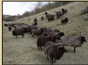
in the field

The sheep eat bramble, shrubs and other rough vegetation. Without this grazing lowland England's hills and fields would become covered by scrub. Grazing keeps the scrub down, allowing sunlight to reach the grassland plants. The sheep's hooves gently disturb the soil, providing small gaps for delicate seedlings to germinate.