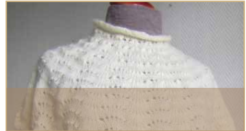
our knit kits