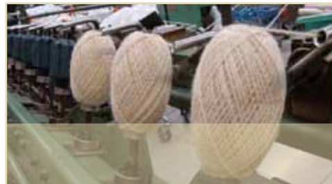
from field to fibre